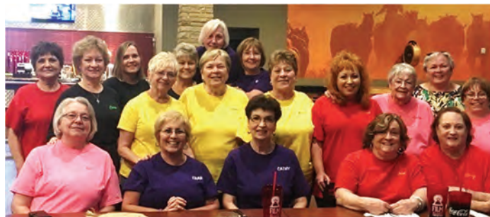
Members of the PCWNC Bowling teams