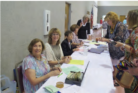
Lunch check-in & membership renewal

You can see more pictures at PCWNC.org , Photo Galleries, June 2017 General Meeting