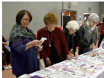
Plenty of shopping