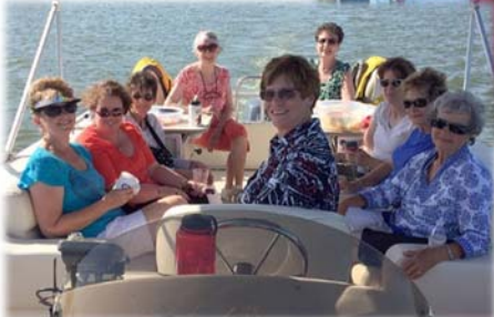
Friends Connecting outings