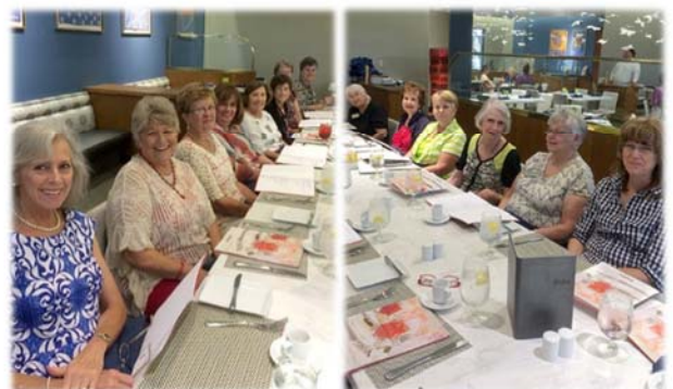
July Lunch Bunch