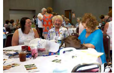
All of our ladies catching up with their friends