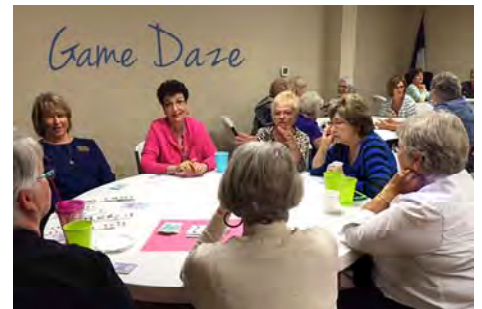
June Game Daze