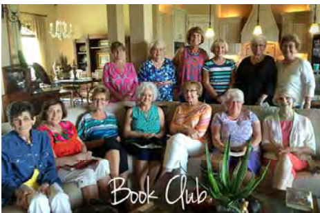
June Book Club