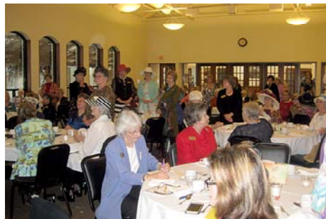
The beautiful Doss Center