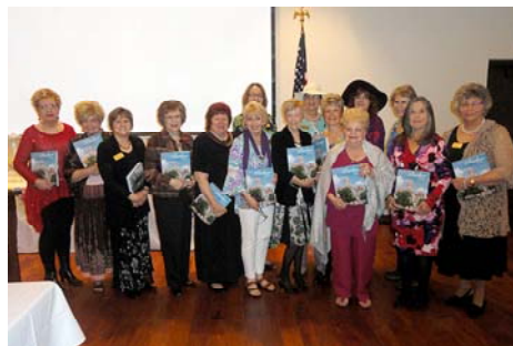
Door prize winners with The Story of Parker County Texas donated by the Doss Center